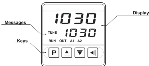
Fig. 02 - Identification of the parts referring to the front panel

The controller's front panel, with its parts, can be seen in the Fig. 02: